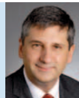
Mercedes Bresso President of the Committee of the Regions

“Europe 2020“ sets out a new vision for modernizing Europe and Europe's economy in the upcoming years. The last few years have been marked by the longest and deepest recession in EU history and, at the same time, by an outstanding set of joint, quick and effective actions. The “Europe 2020“ strategy launched on March 26 2010, is meant to look ahead: it reflects the huge socio-economic challenges Europe will face within the next decades and focuses on targets in key areas where action is needed to boost sustainable growth and competitiveness in Europe.